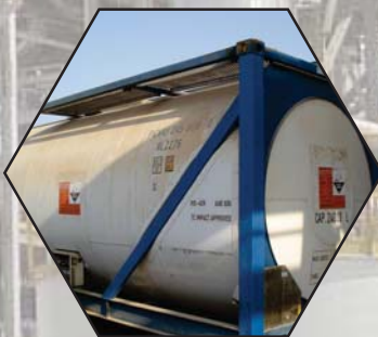
25 T Tanker

UFC with 70% to 85% solid content as per customer need