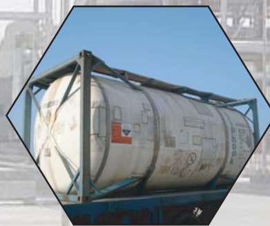
25 T Tanker