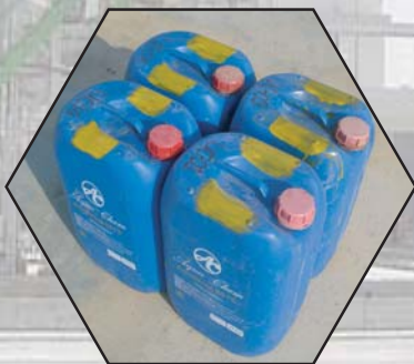
30 L Canister

AF with 37% to 42% Formaldehyde & up to 7% Methanol as per customer requirement.